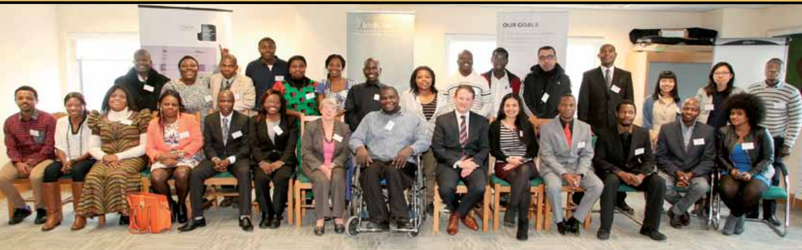
Above and right: Scholarship recipients attending the Irish Aid Fellowships Seminar in Limerick in April 2015